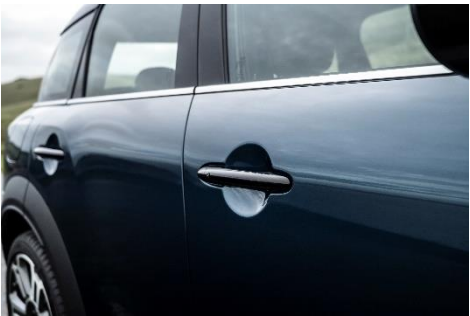
Piano Black Exterior (3L2)