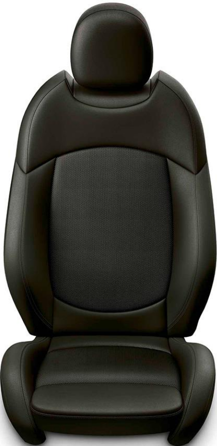
Leatherette Carbon Black Sports Seats (K9E1)