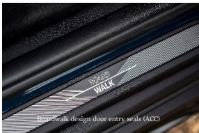
Boardwalk design door entry seals (ACC)