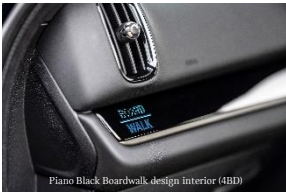
Piano Black Boardwalk design interior (4BD)