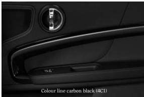
Colour line carbon black (4C1)