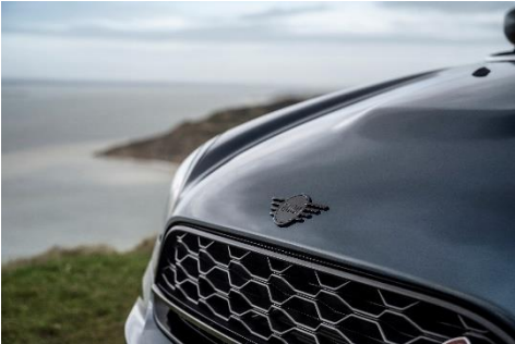
Piano Black front and rear Badges (ACC)