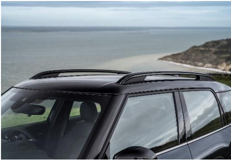
Piano Black Roof Rails (3AA)