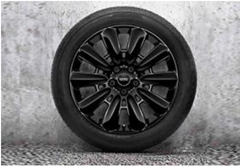
18' Pin Spoke Alloy Wheels in Black (20G)