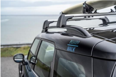
Exterior rear decal 'Boardwalk' (ACC)